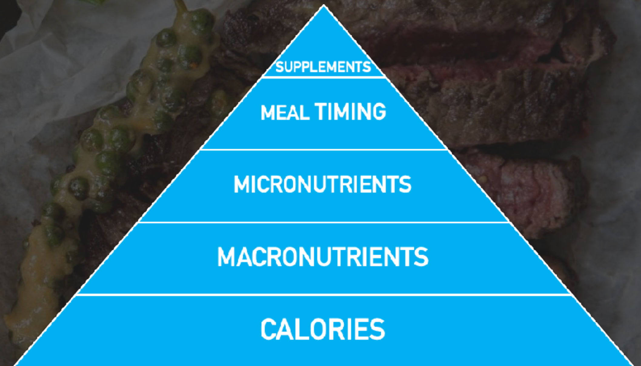
PYRAMID OF NUTRITIONAL PRIORITIES

As we climb the nutritional pyramid it's important to remember that the higher you climb the smaller the returns you'll see.